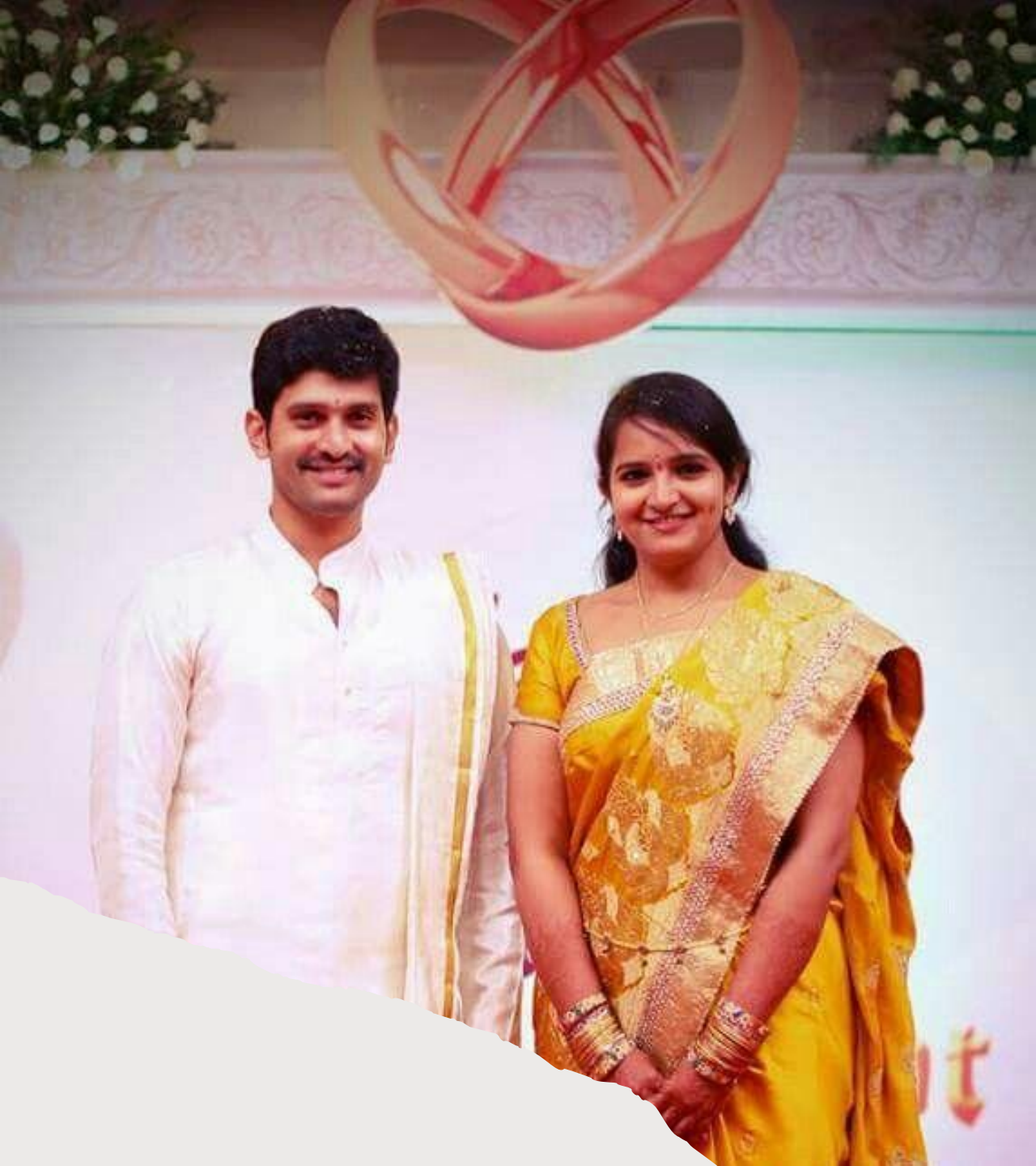
Clothes of Telugu people