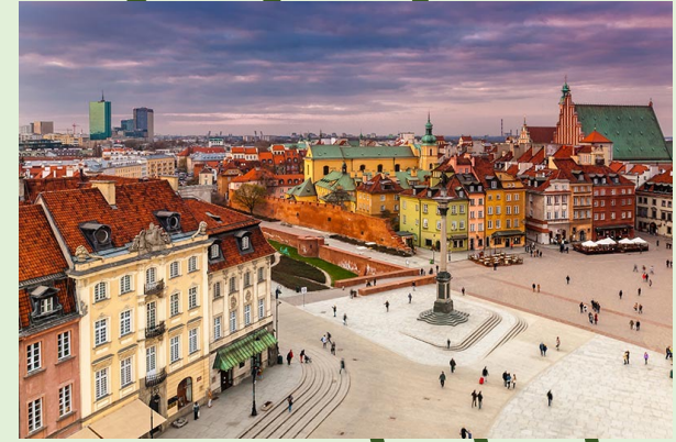
Warsaw old city