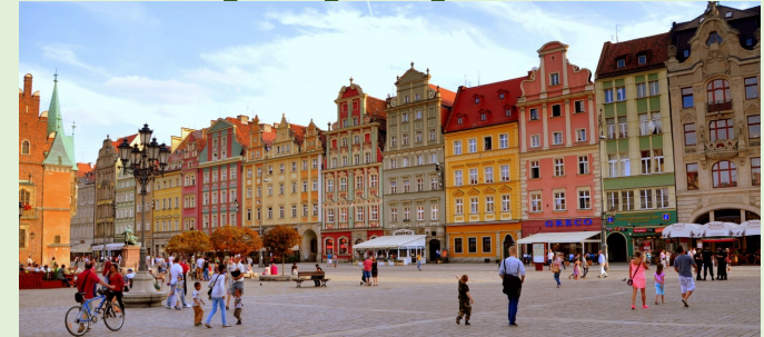
Wroclaw old city